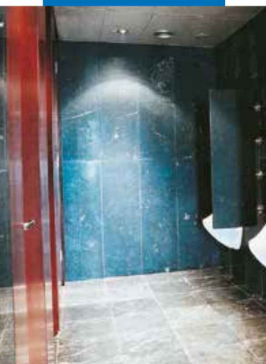
An example of the installation of marble to walls with Keraquick S1 - Feuchtwangen casinò bathroom (Germany)