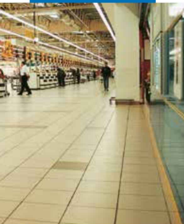
An example of an installation with Keraquick S1 in an Auchan supermarket - Sosnowiec (Poland)