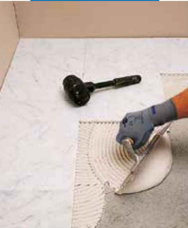
Setting white Carrara marble with Keraquick S1 white

Tiling installed with Keraquick S1 must not be subjected to washout or rain for at least 3 hours